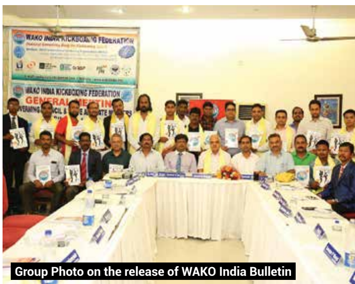
Group Photo on the release of WAKO India Bulletin