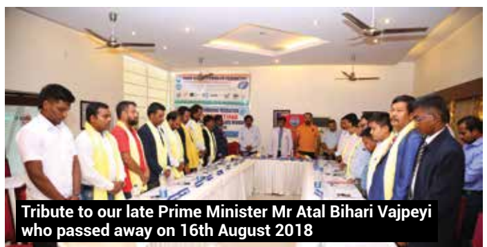
Tribute to our late Prime Minister Mr Atal Bihari Vajpeyi who passed away on 16th August 2018